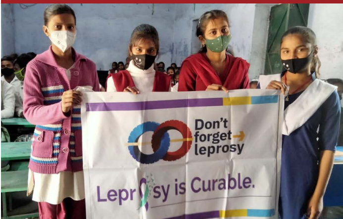
NGO Atma Swabhiman spreads awareness (India, 2022)

Leprosy has been curable for decades, but prejudice and discrimination against persons associated with the disease persist, pushing them to the margins of society and limiting their opportunities in life. Moreover, fear of social stigma can lead those who suspect they have leprosy to hide their condition, hindering efforts at early detection and treatment. Fostering an activist consciousness among persons affected by Hansen's disease is an essential part of the journey to a leprosy-free world.