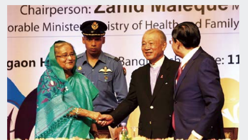
National Leprosy Conference (Bangladesh, 2019)