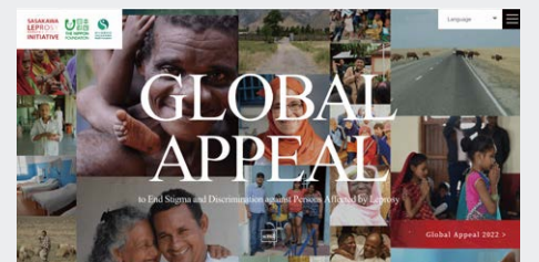
17th Global Appeal (Virtual, 2022)