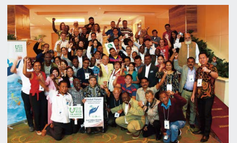
Global Forum (Philippines, 2019)