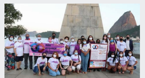
"Don't forget leprosy" campaign by MORHAN (Brazil, 2022)