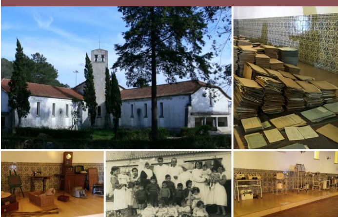
Former chapel at Rovisco Pais Medical Rehabilitation Center, now a museum (Portugal, 2021)

As leprosy and its associated problems become matters of the past, the world is losing evidence of the highs and lows of how humans responded to the disease. Encounters with the stories of individuals and the places that they lived provide opportunities for reflection and formulation of ideas and hopes for the future. In order to advance history preservation, cooperation must happen among governments, experts, and individuals with direct experience.