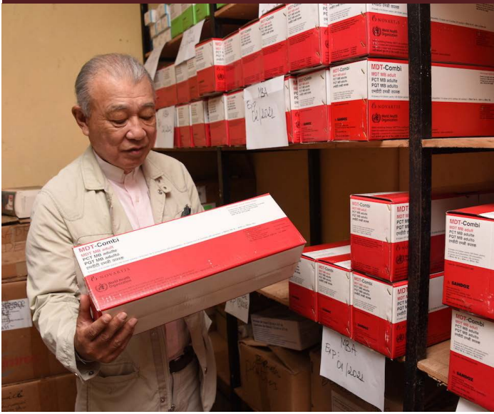
The Goodwill Ambassador inspects stocks of MDT (Union of Comoros, 2018)

In countries where leprosy has been eliminated as a public health problem, governments tend to shift their priorities elsewhere. The challenge is to keep governments engaged so that detection and treatment of new cases continues, and people have access to leprosy services. The WHO Goodwill Ambassador for Leprosy Elimination Yohei Sasakawa makes a point of emphasizing to leaders of endemic countries that control measures continue to be necessary. Meanwhile, the Initiative cooperates with WHO, the International Federation of Anti-Leprosy Associations (ILEP), the Global Partnership for Zero Leprosy (GPZL), and other stakeholders to realize the goal of a world without leprosy.