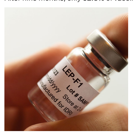
Sample label for a LepVax vaccine vial.

In 2002, ALM began the search for the world's first leprosyspecific vaccine. In early studies, armadillos were used to test the candidate vaccine, which was named LepVax. After nine months, only 12.5% of vaccinated armadillos