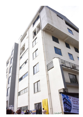
New six-story building in Addis Ababa, Ethiopia, owned by the Ethiopian National Association of Persons Affected by Leprosy (ENAPAL).

The new building represents over 10 years of effort and collaboration. ENAPAL first approached the Ethiopian government around 2011 about the possibility of receiving land for a new headquarters. Six years later, the government transferred a 1,500-square-meter plot to the organization, the first case of its kind in Ethiopia involving a local nongovernmental organization (NGO). After securing the land, ENAPAL approached Goodwill Ambassador Sasakawa during his visit to Ethiopia in July 2018 for support. Sasakawa Health Foundation (SHF) reviewed the plans, and a year later agreed to underwrite most of the construction costs. ENAPAL's