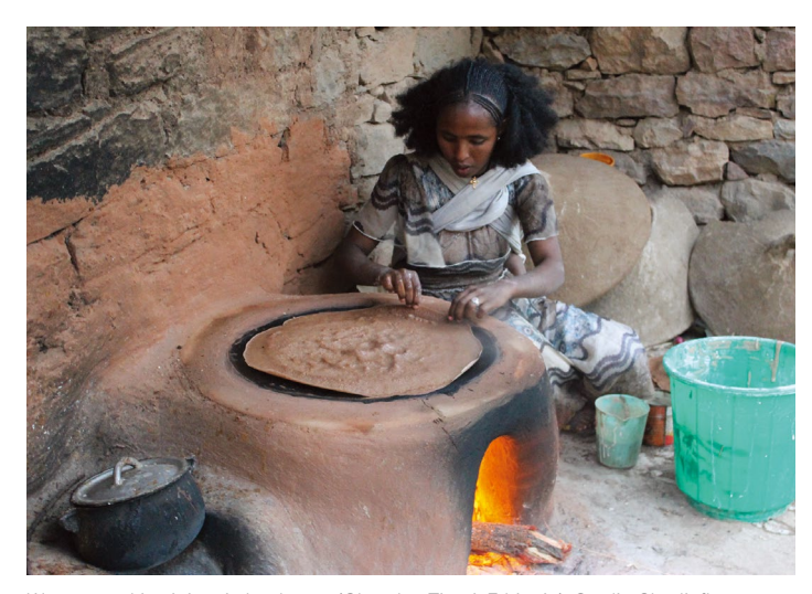
Woman cooking injera in her house (Gheralta, Tigrai, Ethiopia).

Women are strong. I want them to have opportunities to flourish, and I believe that supporting women results in better outcomes for children as well.