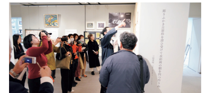
A press preview of the Special Exhibition: "Connecting with Artistic Spirit: 100 Years of Paintings at Tama Zenshoen"

All these developments have had a significant impact on the work of the museum. In order to eliminate stigma and discrimination through the dissemination of accurate knowledge and awareness-raising, and to restore the honor of those affected and their families, we will review our activities, prioritize what needs to be done and develop effective projects. We ask for your continued warm support.