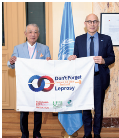
Yohei Sasakawa with UN High Commissioner for Human Rights Volker Türk (right)

The Don't Forget Leprosy campaign launched in 2021 continued in FY2023, with various activities to promote efforts against the disease. In particular, WHO Goodwill Ambassador for Leprosy Elimination Yohei Sasakawa urged heads of state and leaders of international organizations to support the campaign during his meetings with them.