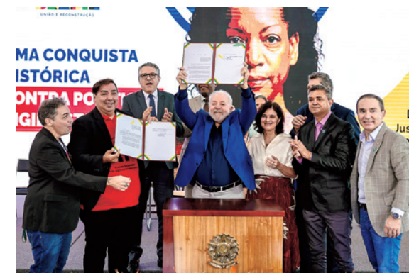
President Lula da Silva of Brazil holds up a bill that he has just signed into law in the presence of Health Minister Nisia Trindade and MORHAN representatives, expanding eligibility for a special monthly pension related to Hansen's disease. (Brasilia, Brazil, November 24, 2023)

In November 2023, MORHAN's years of advocacy with the government bore fruit, with the approval of a bill to provide compensation in the form of a lifetime pension to persons forcibly isolated on grounds of leprosy and their children who were separated from them. The signing ceremony in Brasilia, presided over by President Lula da Silva, who took office in January 2023, was attended by 550 MORHAN members from all over Brazil.