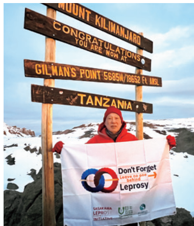
Yohei Sasakawa, the WHO Goodwill Ambassador for Leprosy Elimination, displays a Don't Forget Leprosy banner atop Mt. Kilimanjaro, Africa's highest peak. (Gilman's Point [5,685 meters], Mt. Kilimanjaro, Tanzania, February 12, 2024)