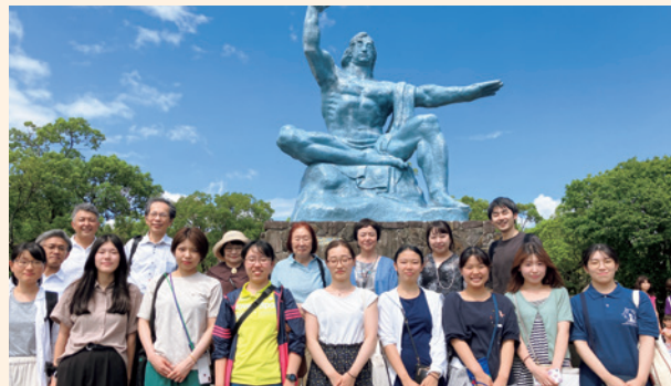
Students participating in Mirai-Juku

professions, participated in group work, and conducted field work at museums and archives in Nagasaki, deepening exchanges among each other. A report is available on the Foundation's website.