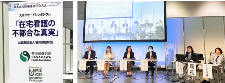
Hosting a symposium on "The Inconvenient Truth Behind Home-Care Nursing" at the 5th Annual Meeting of the Japanese Association for Home Care Medicine.