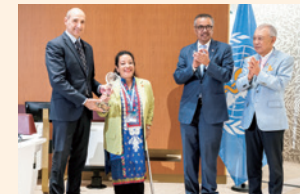
Representative of the Nick Simons Institute (second from left)