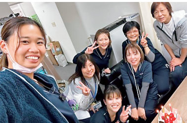
Trainees taking part in on-the-job training with colleagues from their host office