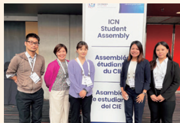
Nursing students from Japan participate in the ICN Student Assembly

Another initiative is to send Japanese nursing students to the biennial congress of the International Council of Nurses (ICN), which attracts thousands of people from around the world. We provided partial funding for 12 Japanese undergraduate and graduate nursing students to attend 2023 congress in Montreal and the ICN Student Assembly held the day before. During their time at the congress, the students interacted with world-class researchers