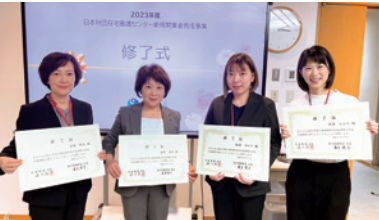
All trainees presented their business plans and completed their training.