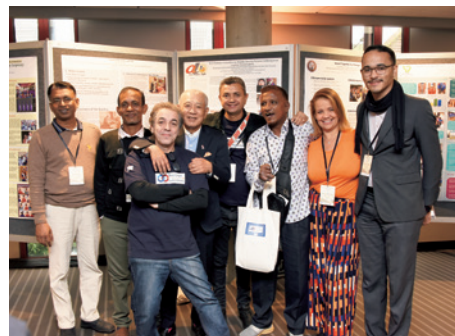
Goodwill Ambassador for Leprosy Elimination Yohei Sasakawa (4th from left) with conference participants during a poster session on best practices of people's organizations at the Bergen International Conference on Hansen's Disease (Bergen, Norway, June 22, 2023)