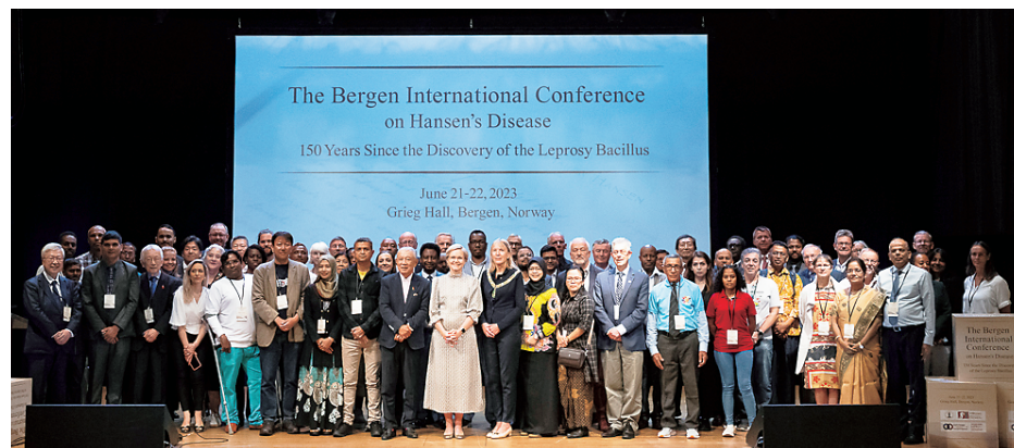
Participants pose for a group photo at the Bergen International Conference on Hansen's Disease (Bergen, Norway, June 21, 2023)