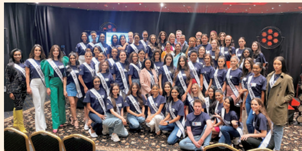
Miss Supranational contestants from 65 countries and regions (Krakow, Poland, July 2023)

Indicating the interest in the topic, the contestants asked many questions during the Q&A session, including about symptoms and how the disease is transmitted, and there wasn't enough time to answer them all. After the end of the pageant, many Miss Supranational contestants shared information about leprosy on social media.