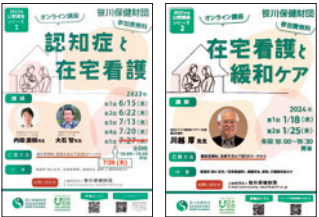
Flyers for online seminars on "Home-Care Nursing and Dementia" and "Home-Care Nursing and Palliative Care".