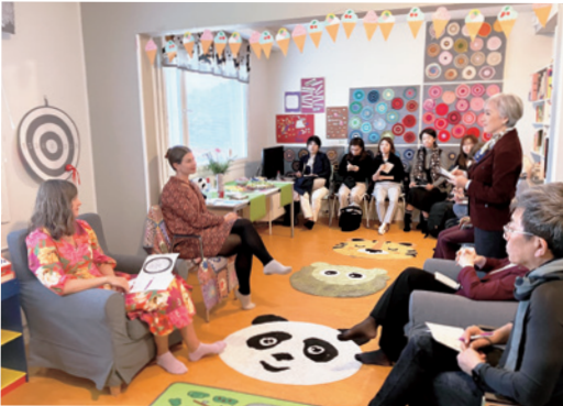
Participants listen to an explanation at a shelter for victims of domestic violence in Finland.

To confront the challenges associated with a super-aging society and population decline and consider how to respond as nurses, we recruited applicants for a study tour of Nordic countries from among 1,000 managers and staff of approximately 160 offices of The Nippon Foundation Nursing Center Network. The 12-member delegation visited Finland, which is ranked as the world's happiest country, and Denmark, which, like Finland, is known as a high welfare country. In Finland, the itinerary included a "neuvola" maternity and child care clinic, and an end-of-life care facility, and in Denmark care homes for the elderly. Many of the participants not only praised the efforts of the countries they visited, but also said that it is important for Japan to adopt policies that reflect our own cultural and social environment. A report of the visit is available on the Foundation website.