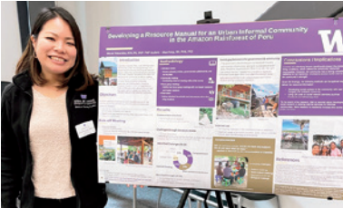
A fellow studying at the University of Washington gives a presentation about her summer internship in Peru.

In FY2023, five new students began their graduate studies in the United States. You can see the diverse environments in which the five fellows are studying on the Foundation's official website. Fellows preparing to study abroad in FY2024 also did well, with 13 accepted to graduate courses in the United States and Canada. Before heading overseas, the fellows went on a field trip to Kumamoto Prefecture in southwest Japan to learn about community health care and social issues in the region, and found out a lot about home-care nursing, some diseases with a history of social discrimination, welfare and other issues.