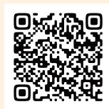
Mirai-Juku report (Japanese only)