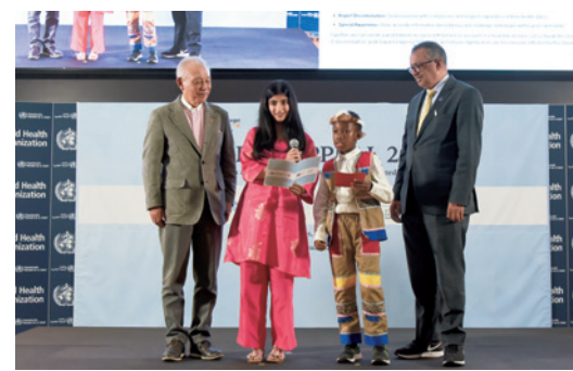
WHO Director-General Dr. Tedros Adhanom Ghebreyesus and WHO Goodwill Ambassador Yohei Sasakawa look on as children read out the text of Global Appeal 2024. (Geneva, Switzerland, January 31, 2024)

On January 31, 2024, the launch ceremony for Global Appeal 2024 to end stigma and discrimination against persons affected by leprosy was held at WHO headquarters in Geneva, Switzerland. At the ceremony, WHO Director-General Dr. Tedros Adhanom Ghebreyesus and WHO Goodwill Ambassador Yohei Sasakawa signed the appeal, which calls for ending discrimination by disseminating correct information about leprosy and ensuring that no one is left behind because of a treatable disease. In a discussion with the Goodwill Ambassador, Director-General Tedros said that the WHO's Global Leprosy (Hansen's disease) Strategy 2021-2030 clearly sets out what is needed to achieve zero leprosy, and pledged to do his utmost to support countries in implementing it.