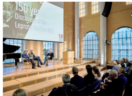
Event marking the 150th anniversary of Dr. Hansen's discovery of the leprosy bacillus (Bergen, Norway, February 28, 2023)

Through these events, we were able to collaborate with many stakeholders and the anniversary proved to be a valuable opportunity to disseminate accurate information about leprosy and dispel prejudice toward those affected by the disease.