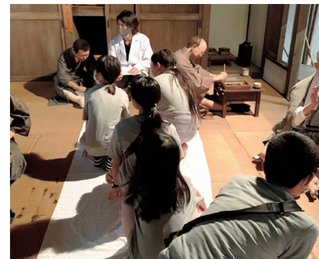
Elementary school children listen to an explanation inside a diorama of a sanatorium dormitory at a "hands-on" exhibition over the summer vacation

Our activities have also included museum talks on Hansen's disease from different perspectives, seminars on Hansen's disease and human rights, and lectures and events for elementary school children during the summer vacation. In addition to this, we have also been focused on organizing the material in the museum's collection.