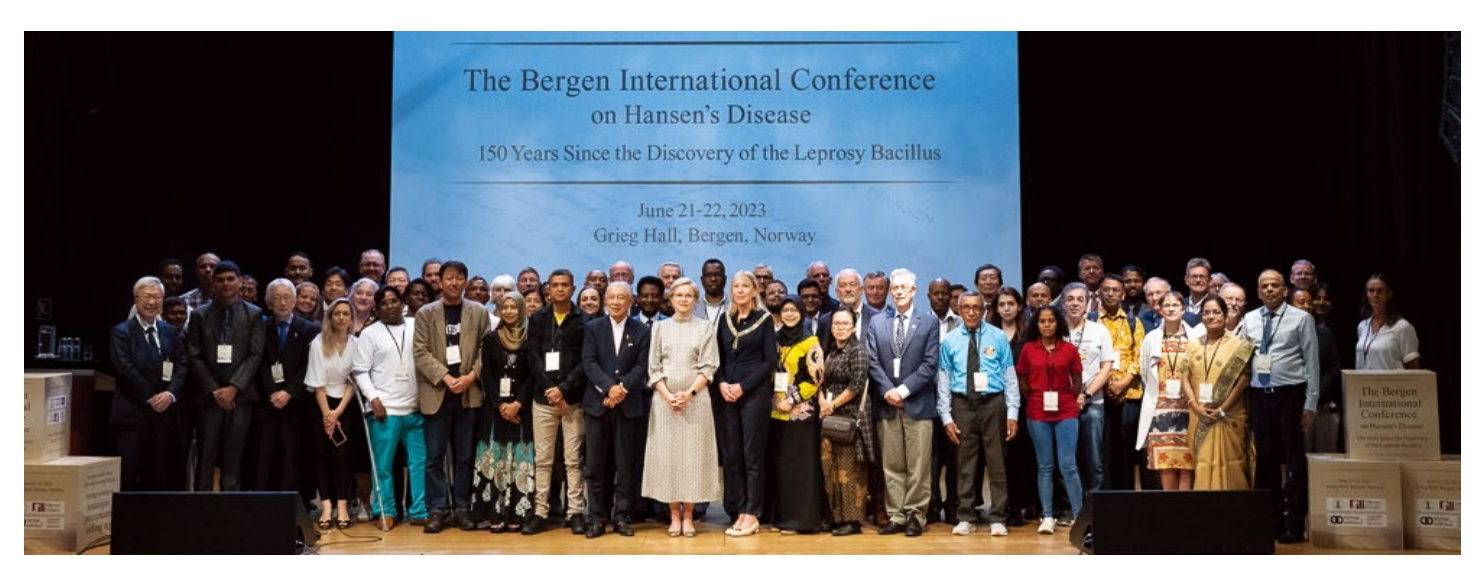
Commemorative photograph of speakers at the Bergen International Conference on Hansen's Disease (Norway, June 22, 2023).