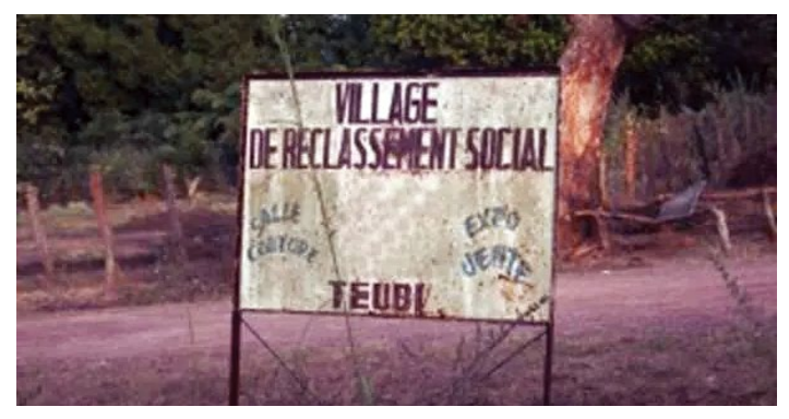
Sign marking the entrance to Teuby, one of Senegal's nine villages de reclassement social (VRS).

For 47 years, Senegal has had nine villages de reclassement social (VRS), created by the authorities and governed by Law 76-03 of 1976. At the time that they were established, the VRS were intended to isolate persons affected by leprosy and block transmission of the disease. The VRS system continued until 2023 even though leprosy has been a curable disease since the 1980s and "leprosy as a public health problem" was declared eliminated at the national level in 1995.