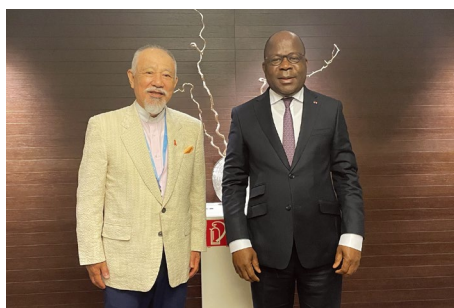
Mr. Pierre N'gou Dimba, Minister of Health, Public Hygiene and Universal Health Coverage, Côte d'Ivoire

Tanzania is making coordinated efforts to promote case detection in rural areas, train health workers, and conduct monitoring, while also placing emphasis on the social integration of persons affected. Agreement was reached that the Goodwill Ambassador will visit before the end of the year.