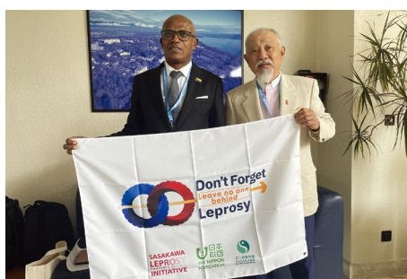
Dr. Nassuha Oussene Salim, Minister of Health, Solidarity, Social Protection and Gender Promotion, Comoros

The Minister shared information about leprosy in Mozambique and challenges in the northern region. The country's policy emphasizes the importance of prevention and awareness activities at the community level.