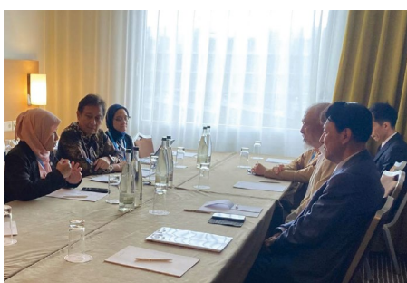
Mr. Budi Gunadi Sadikin, Minister of Health, Indonesia

The country is focusing on the role of nurses. They are committed to optimizing treatment systems and strengthening interregional cooperation.