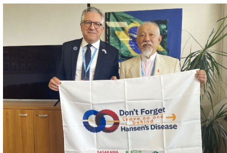
Dr. Alexandre Rocha Santos Padilha, Minister of Health, Brazil

Brazil will hold a national conference in March 2026. President Lula's support has been confirmed. Brazil and India, the two states with the highest number of leprosy patients, are in communication about how they might cooperate.