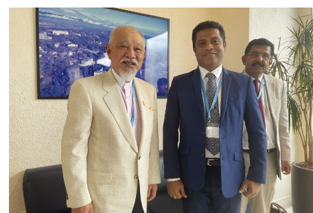
Dr. Nalinda Jayatissa, Minister of Health and Mass Media, Sri Lanka

The Secretary explained how the country has reduced misdiagnosis through a teleconsultation system based on mobile phones. He stated emphatically that he wants to achieve zero leprosy during his lifetime.