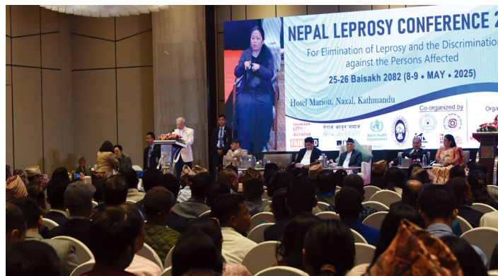
WHO Goodwill Ambassador Sasakawa gives a speech at the Nepal Leprosy Conference 2025 in the presence of Minister of Health and Population Pradip Paudel (seated center left) and Prime Minister KP Sharma Oli (center right) on May 8, 2025.

The Goodwill Ambassador thanked the Prime Minister for his support for the conference, noting that the national leader showed immediate enthusiasm for the idea when it was first suggested during a meeting in September. He also expressed his deep respect for the important role played by self-help groups (SHGs) of persons affected by leprosy in early detection, treatment, and awareness-raising activities.