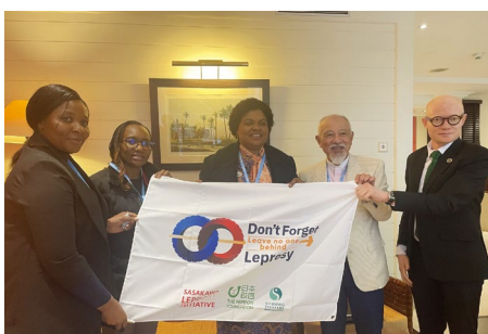
Ms. Jenista Joakim Mhagama, Minister of Health, Tanzania

Active case-finding is yielding results. The Goodwill Ambassador was asked to visit and evaluate the program.