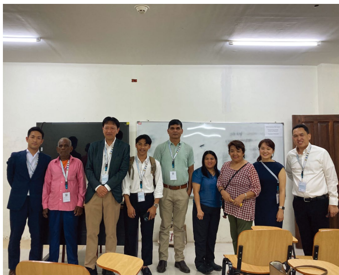
Representatives of the Sasakawa Leprosy (Hansen's Disease) Initiative, organizations of persons affected by leprosy, and their local support organizations stand together after making a joint presentation at the 13th International Society for Third-Sector Research (ISTR) Asia-Pacific Regional Conference held in Cebu, the Philippines (Apr. 23, 2025).

Attending the conference and visiting the hospital gave the representatives knowledge and connections that they can put to use for their respective organizations and countries. The opportunity to spend time together in person also contributed to promoting international exchange among organizations of persons affected by leprosy.