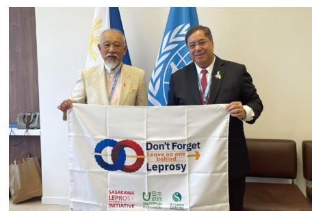
Dr. Teodoro Herbosa, Secretary of Health, Philippines

his direction, screening goals are being accelerated, starting with 200 districts that have not yet met the "elimination as a public health problem" target. The Ministry of Health is also working on responding to instances of fatality linked to severe leprosy reactions as well as developing a system of post-exposure prophylaxis for close contacts. At the 22nd International Leprosy Congress to be held in Bali in July, the Minister and the Goodwill Ambassador will hold a joint session, after which they will travel together to visit endemic areas.