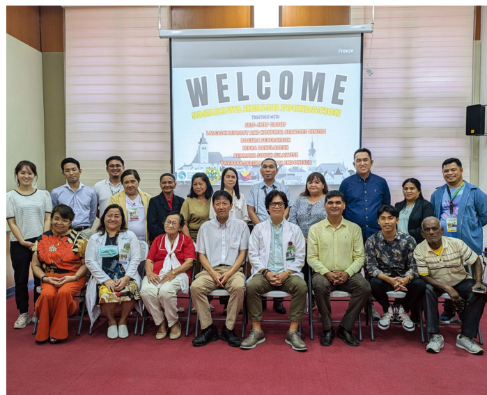
The representatives visited the Eversley Childs Sanitarium and General Hospital in Mandaue, Cebu, the Philippines. The residential area of the sanitarium, which was established in 1930, continues to house 35–40 persons affected by leprosy who have been cured of the disease (Apr. 24, 2025).

SASAKAWA LEPROSY HANSEN'S DISEASE INITIATIVE