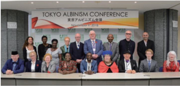
A first for Japan: an international conference on albinism

Tokyo Albinism Conference touches on some familiar themes for leprosy.