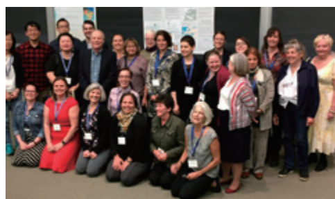
Conference emphasized "commonalities between scholars" working on leprosy in fields not normally brought together

We look forward to the second meeting of Leprosy and the ‘Leper’ Reconsidered because we hope to continue to foster a strong dialogue between the humanities and the sciences so that we can develop well-rounded and accessible studies in order to continue to demystify leprosy and the people who are impacted by it. ■