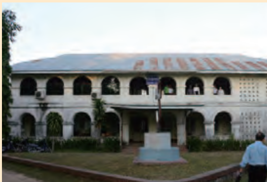
With a resident of Mawlamyine Christian Leprosy Hospital (top); hospital exterior (above)