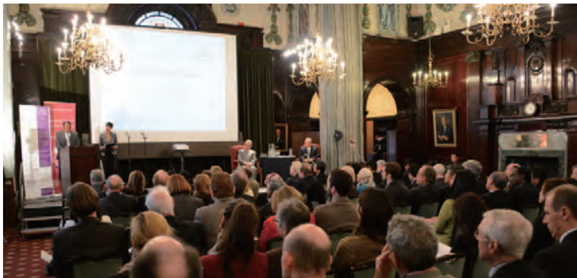
Around 200 people gathered at the Law Society in London for the launch of Global Appeal 2013.

The 8th Global Appeal takes aim at outdated legislation on leprosy.