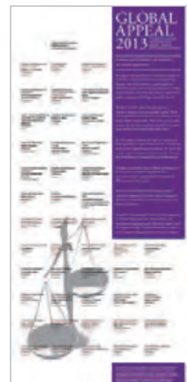
A PDF of Global Appeal 2013 can be downloaded from The Nippon Foundation website.

For the NFI chairman, addressing the ceremony was a personal landmark in the fight for dignity and recognition. He later said: “I do not have the words to express how privileged and proud I felt to represent my country at the Law Society as a grassroots activist and as a person affected by leprosy.” ■