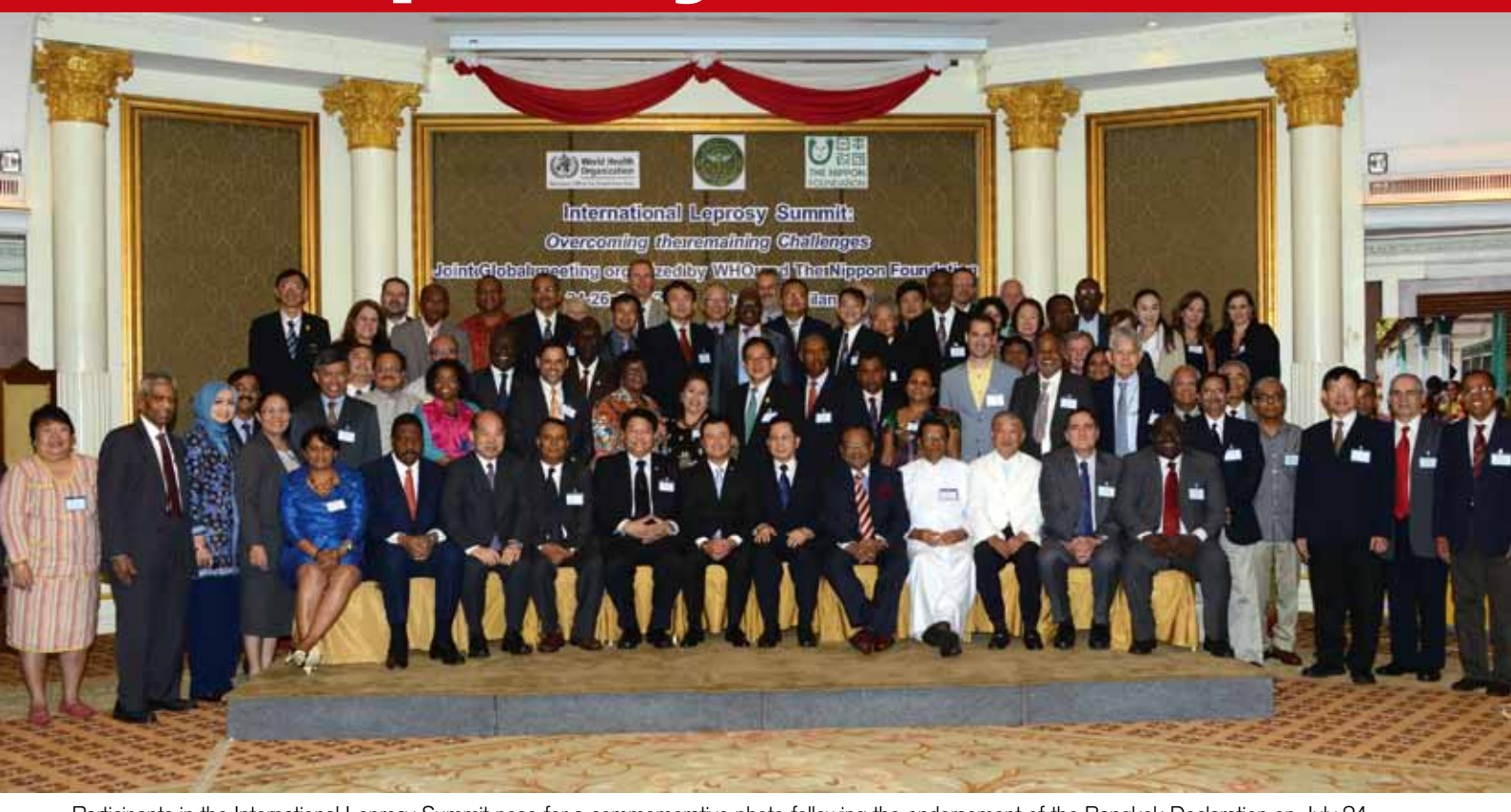
Participants in the International Leprosy Summit pose for a commemorative photo following the endorsement of the Bangkok Declaration on July 24.