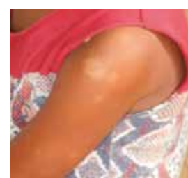
Close-up of lesions on shoulder and arm of a child