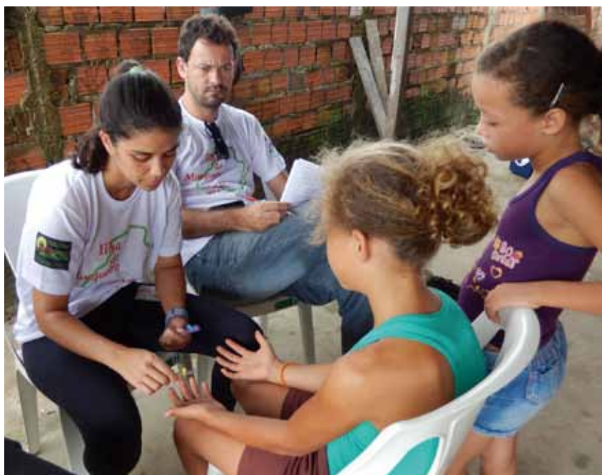
(Left) Assessing muscle strength in the hands of a child diagnosed with leprosy on Mosqueiro Island outside of Belém, Pará; (right, top and bottom) homes on the edge of the Amazon River.