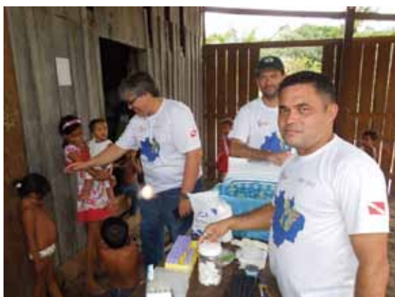
Visiting the home of a child diagnosed with leprosy to examine household contacts in Oriximiná, Pará

As well as active surveillance for clinical signs of leprosy, we are trying to develop tests to