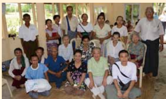
(Top) Elderly residents of Mitta nursing home in Mayanchaung Resettlement Village; (above) with worshippers at the Baptist church

had held them back until the damage was done.