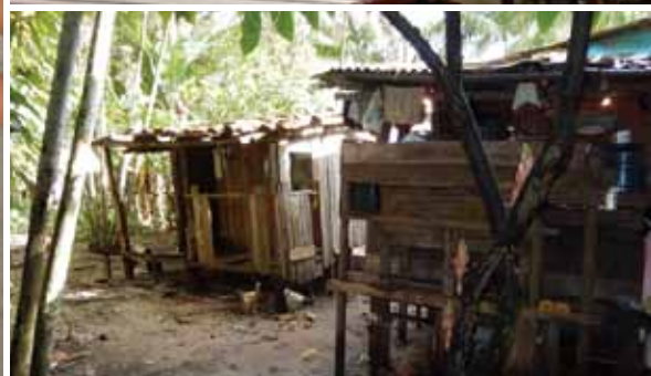
(Left) Assessing muscle strength in the hands of a child diagnosed with leprosy on Mosqueiro Island outside of Belém, Pará; (right, top and bottom) homes on the edge of the Amazon River.

schoolchildren at local schools and household contacts, bleeding and examining between 600 to 1,000 people. The team works up to 14 hours a day or longer, sometimes traveling two hours on rough dirt roads to get to schools and homes in rural areas. For some children, this is the first time they will have seen a doctor in their lives.