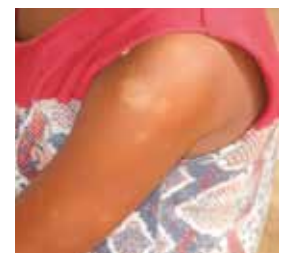
Close-up of lesions on shoulder and arm of a child