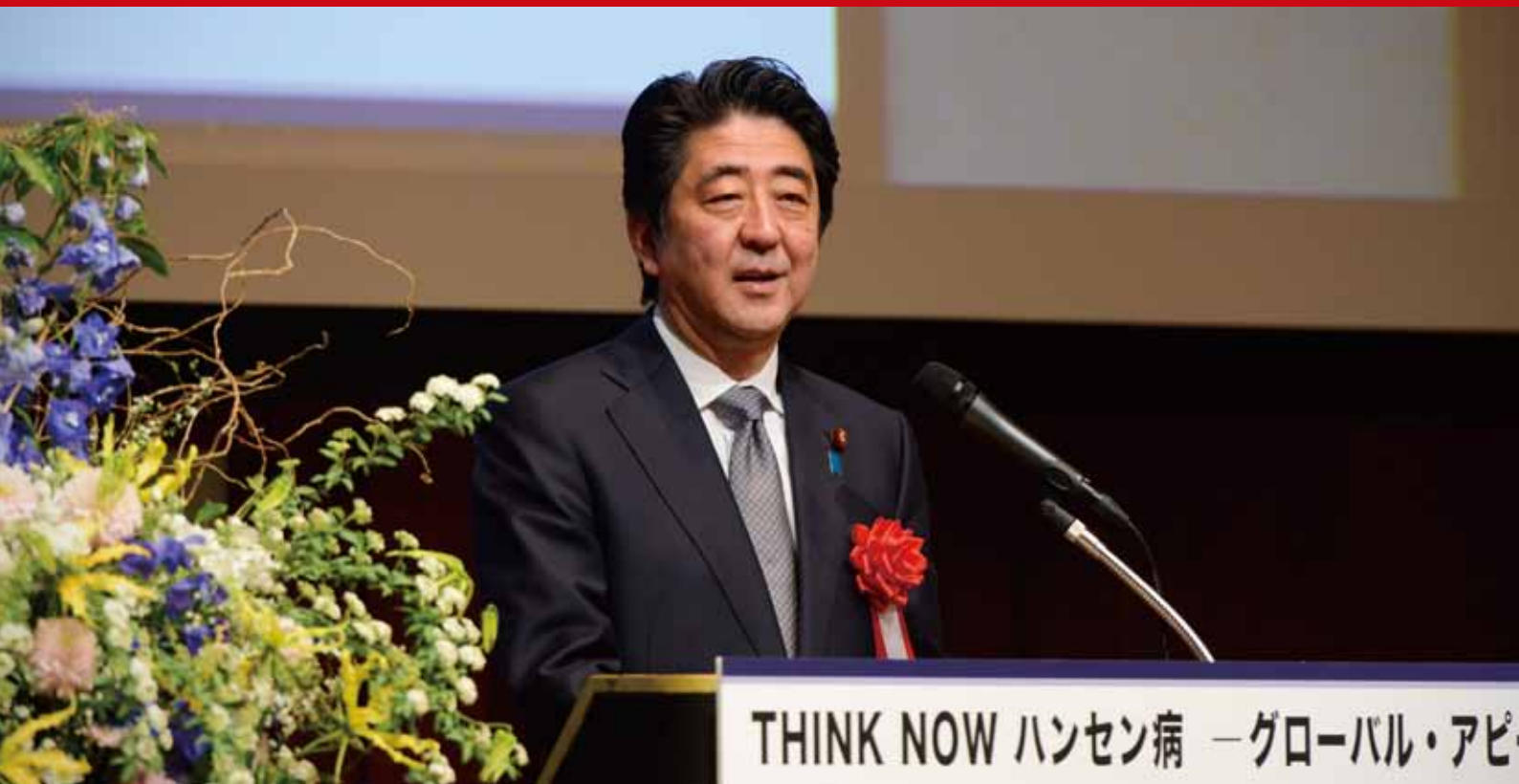
Japanese Prime Minister Shinzo Abe addresses the Global Appeal 2015 launching ceremony in Tokyo on January 27.