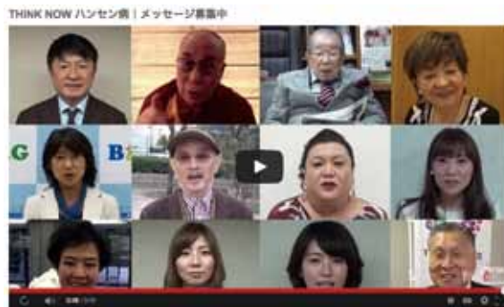
Some of the 1,600 contributors to the online campaign

With the tag line, “To think about leprosy is to think about people,” the “Think Leprosy Now” campaign is set to run until the end of March 2015. ■