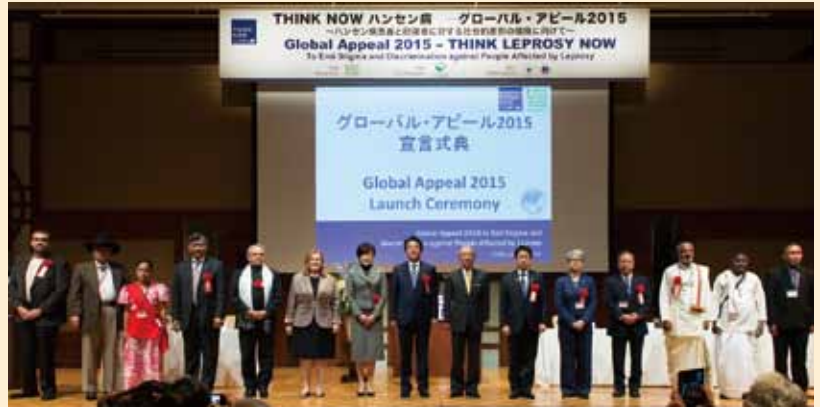
Prime Minister Abe (center) headed the list of dignitaries at the launch ceremony.

very pleased to welcome to my office representatives of both these organizations in January.