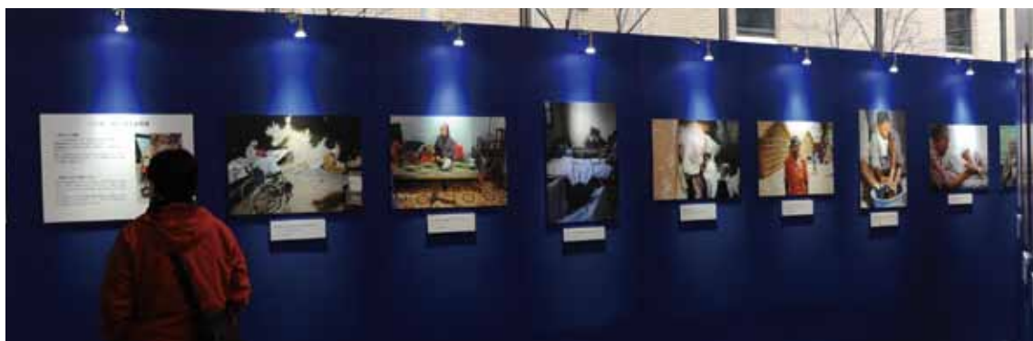
Photo exhibition depicts the lives of people affected by leprosy around the world.

“To think about leprosy is to think about people” was the title of a recent photo exhibition held in Tokyo featuring the work of Nippon Foundation photographer Natsuko Tominaga.