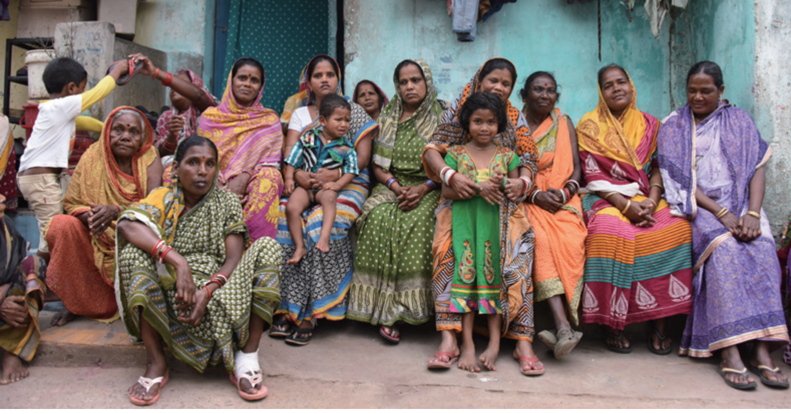
Residents of Rama Krishna Pally leprosy colony in Bhubaneswar, Odisha state, India, visited by the Goodwill Ambassador in March 2017.