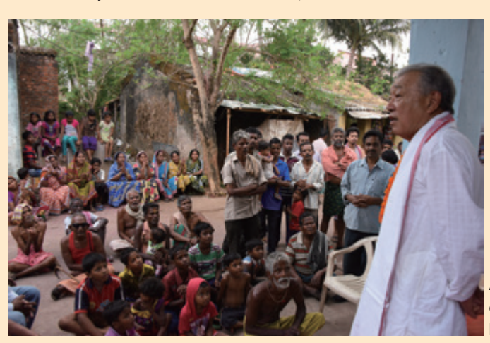
Addressing residents of Rama Krishna Pally leprosy colony

APAL's leaders presented their requests in detail. These covered areas such as enhancement of maintenance allowance, land allocation rights, provision of medical services, and welfare and