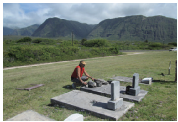
A man contemplates the grave of an ancestor he did not know about.

the people who were sent to Kalaupapa and will feature a curved wall engraved with their names. The lower circle represents the families who were left behind and their descendants. The place where the circles overlap is what Ka 'Ohana O Kalaupapa has always envisioned: reuniting the people of Kalaupapa with their families and descendants.**