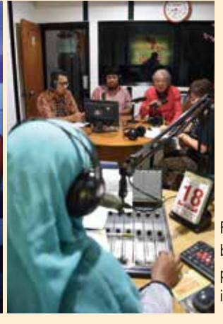
Far left: Appearing in a live TV broadcast in Palu; left: taking part in a radio phone-in show in Makassar