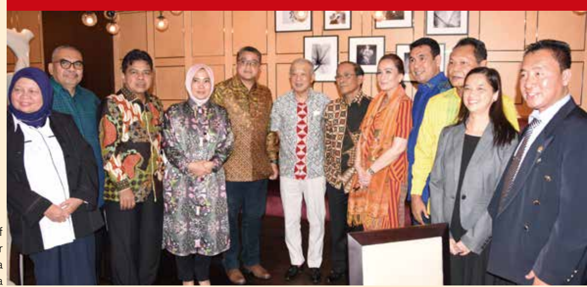
With members of Commission IX and other health representatives at a meeting in Jakarta

is also a person affected by leprosy. We have two children and they are perfectly fine."