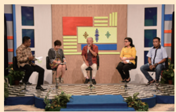
Appearing on TVRI (Televisi Republik Indonesia) to talk about leprosy.

Among those taking part were a number of persons affected by leprosy. They included a pastor diagnosed with leprosy in 2017 who had been