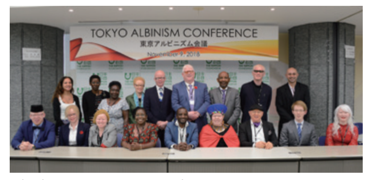
A first for Japan: an international conference on albinism

Tokyo Albinism Conference touches on some familiar themes for leprosy.