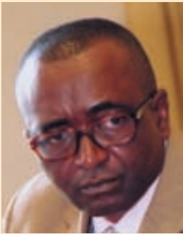
Health Minister Dr. Emile Bongeli Yeikelo Ya Ato

implications that has for the logistics of leprosy elimination. Unfortunately, the areas where there are the most cases of leprosy are also those affected by the ongoing militia violence and unrest, making it harder to achieve effective health coverage.