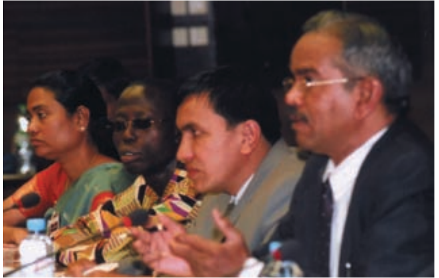
After beating the disease, these cured persons are courageously speaking out

On the other hand, Lee Casey remarked that few people had been regarded for so long, or so universally, as suffering from a divine punishment,