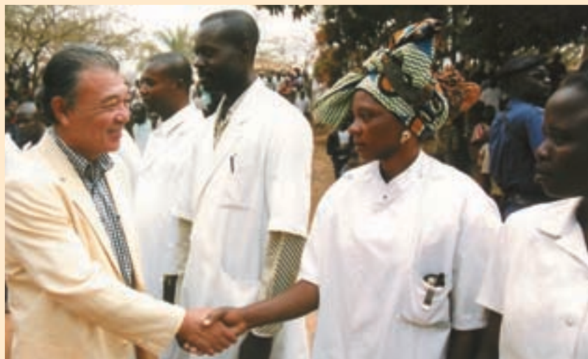
Greeting staff at the Kapolowe leprosy hospital in Katagana Province