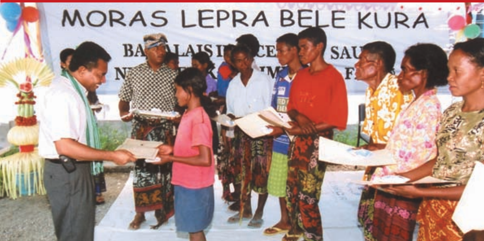
Timor-Leste Health Minister Dr. Rui Maria de Araujo presents certificates to recovered persons at Oecusse Enclave in September.