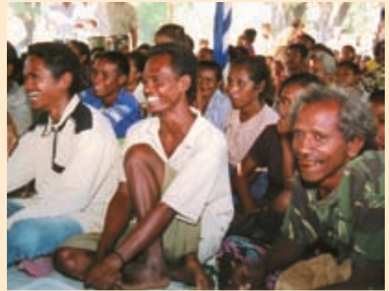
Recovered persons in Oecusse enjoy festivities to celebrate successful completion of their treatment.

According to the most up to date figures, 625 new patients have been registered in the past two years, and the current prevalence rate is 3.9/10,000. Over half — or 388 — live in an enclave called Oecusse.