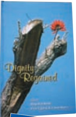
Cover of Dignity Regained (top), flyer for The Best Years of Our Lives