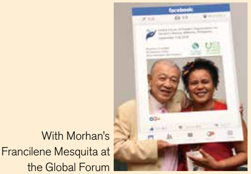
PHILIPPINES (September 8-11)

Time with persons affected by leprosy is time well spent, the Goodwill Ambassador finds on his recent visit to Manila.