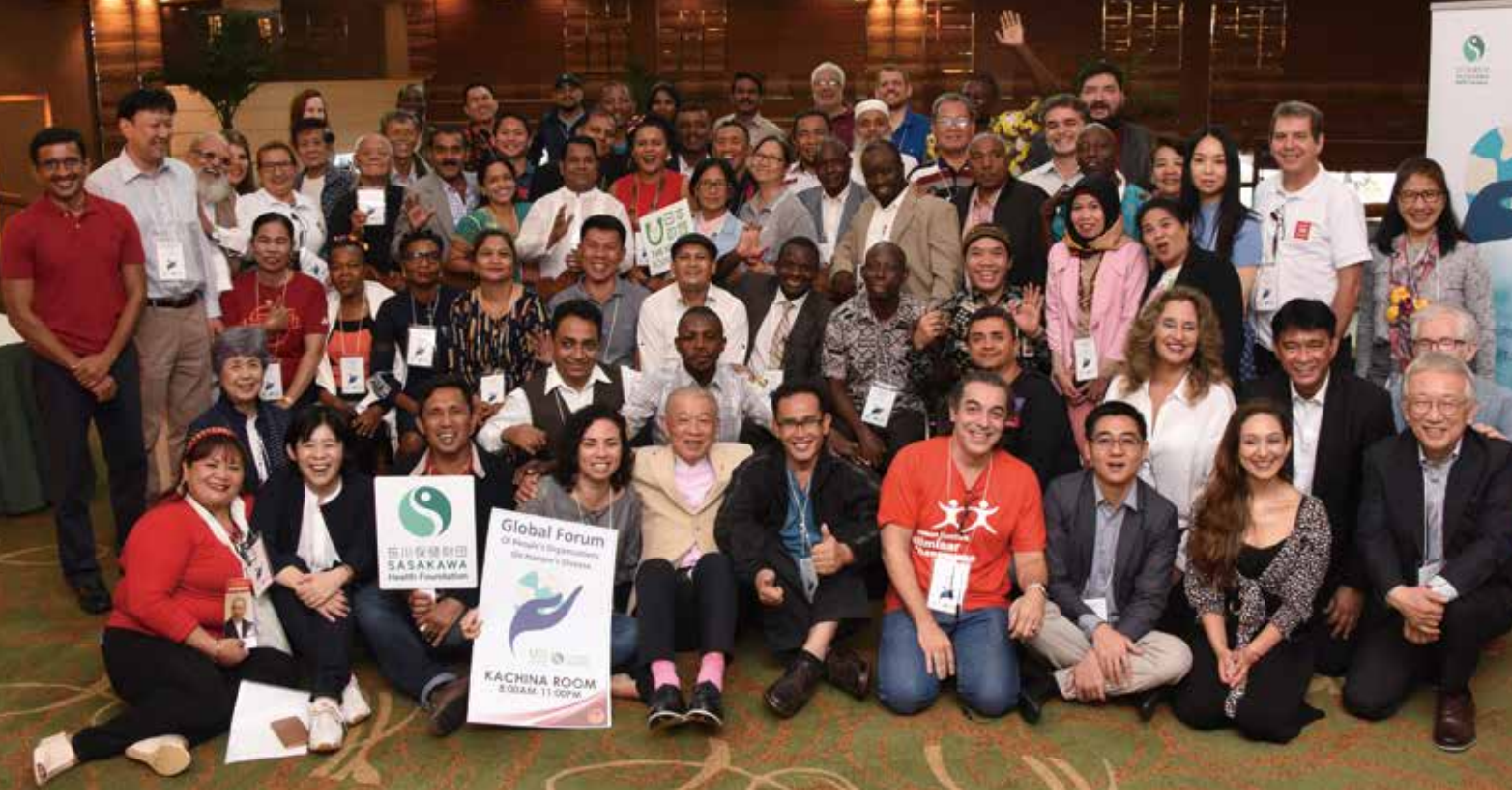
All smiles: participants of the Global Forum of People's Organizations on Hansen's Disease held in Manila pose for a photo on September 9, 2019.