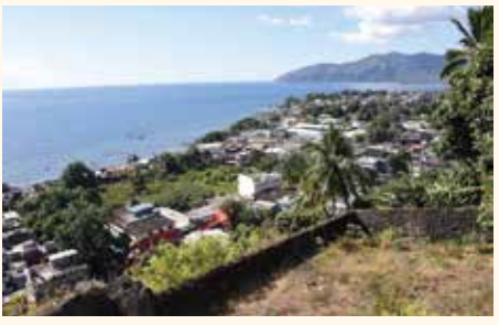
Comoros: the small-island state aims to eliminate leprosy by 2025, according to President Assoumani.

The campaign is set to run for three months. To ensure that this is not a one-off initiative, there was agreement among the health ministry, WHO, the Damien