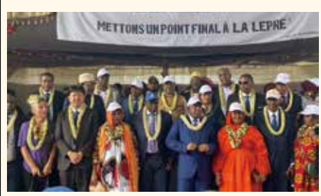
High-level backing: dignitaries at the launch ceremony of the new-case detection campaign

The ceremony took place on the island of Anjouan in the presence of President Azali Assoumani, Health Minister Loub Yacout Zaidou and other high-ranking officials including the governors of the three islands that make up the union, which is located in the Indian Ocean between Mozambique and the northern